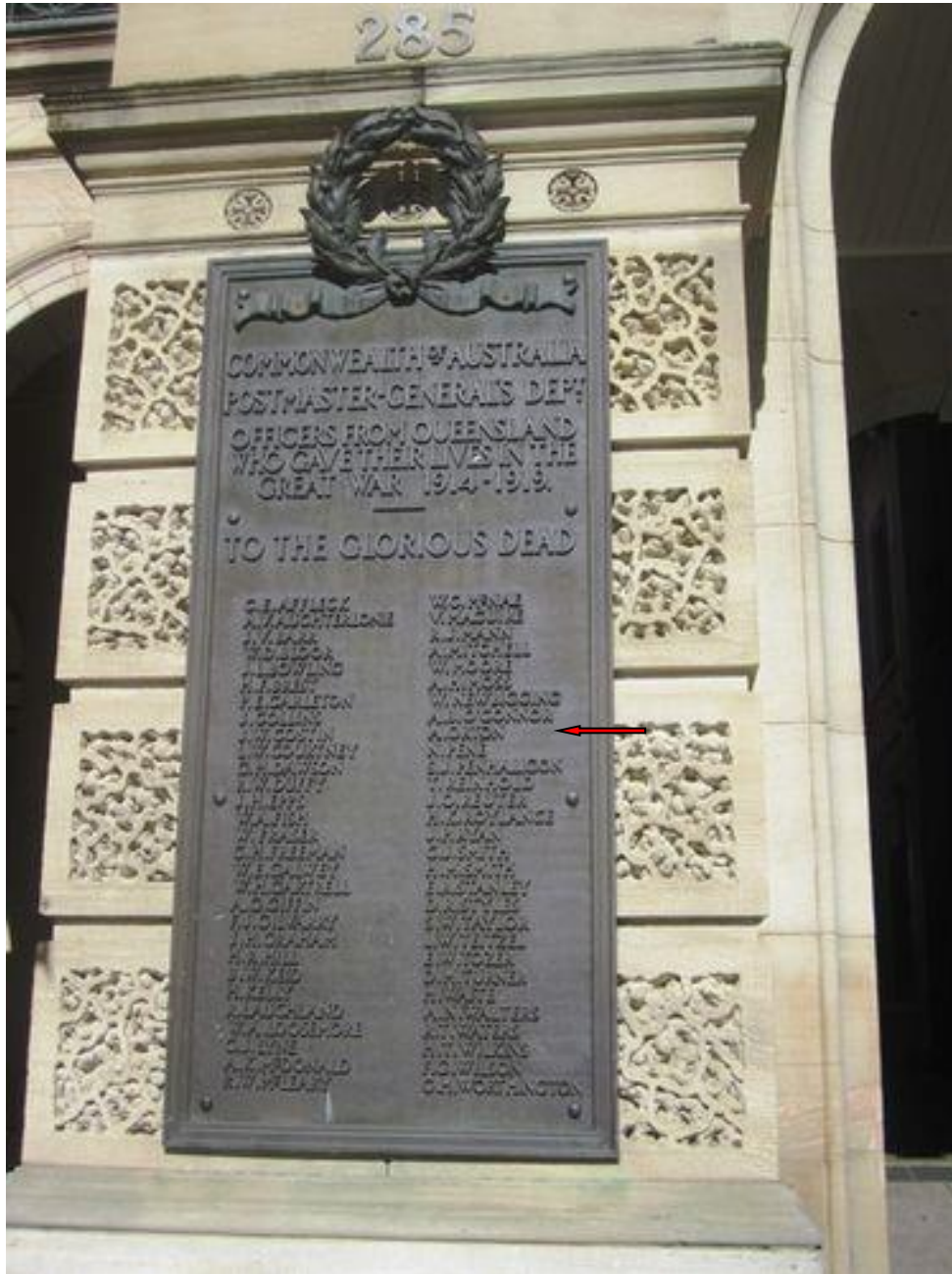
Postmaster-General's Department Roll of Honour