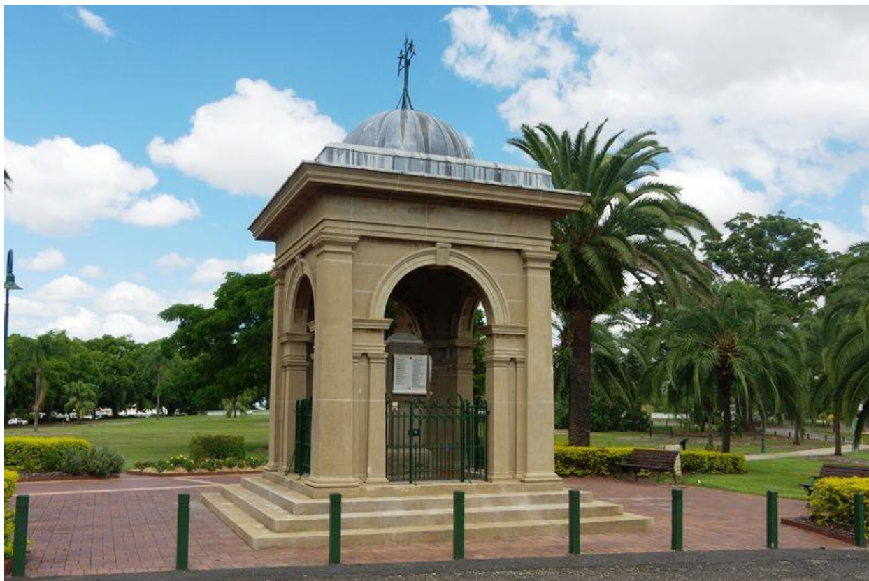
Yeronga Cenotaph / War Memorial