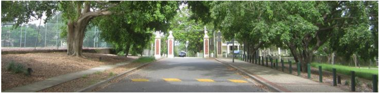
Yeronga Memorial Park & Honour Avenue

The Honour Avenue was a memorial to the soldiers from the Stephens Shire which began in 1917. It was a row of 96 alternating flame trees & weeping figs that lined the newly-created avenue through the Yeronga Memorial Park.