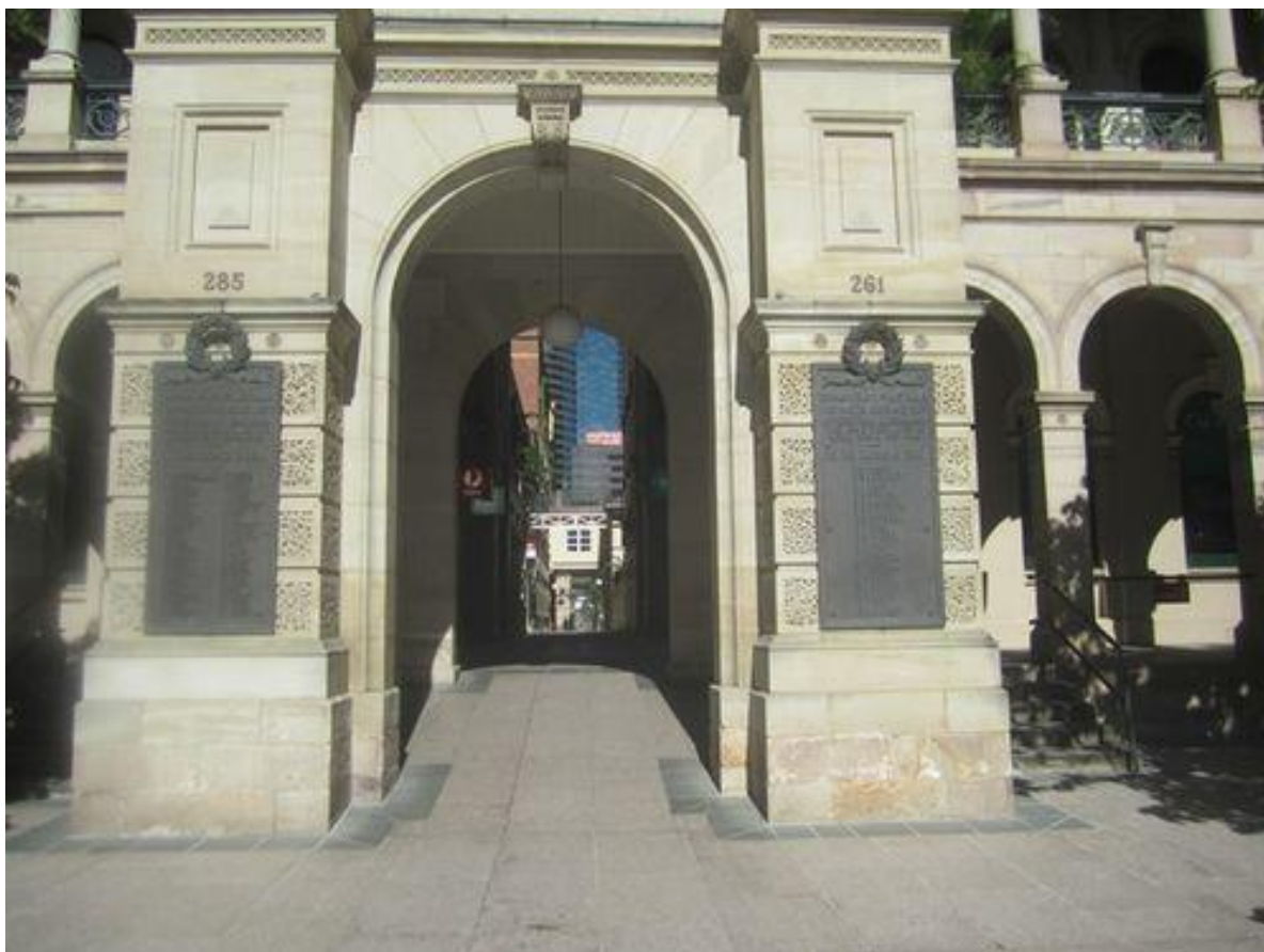
Postmaster-General's Department Roll of Honour