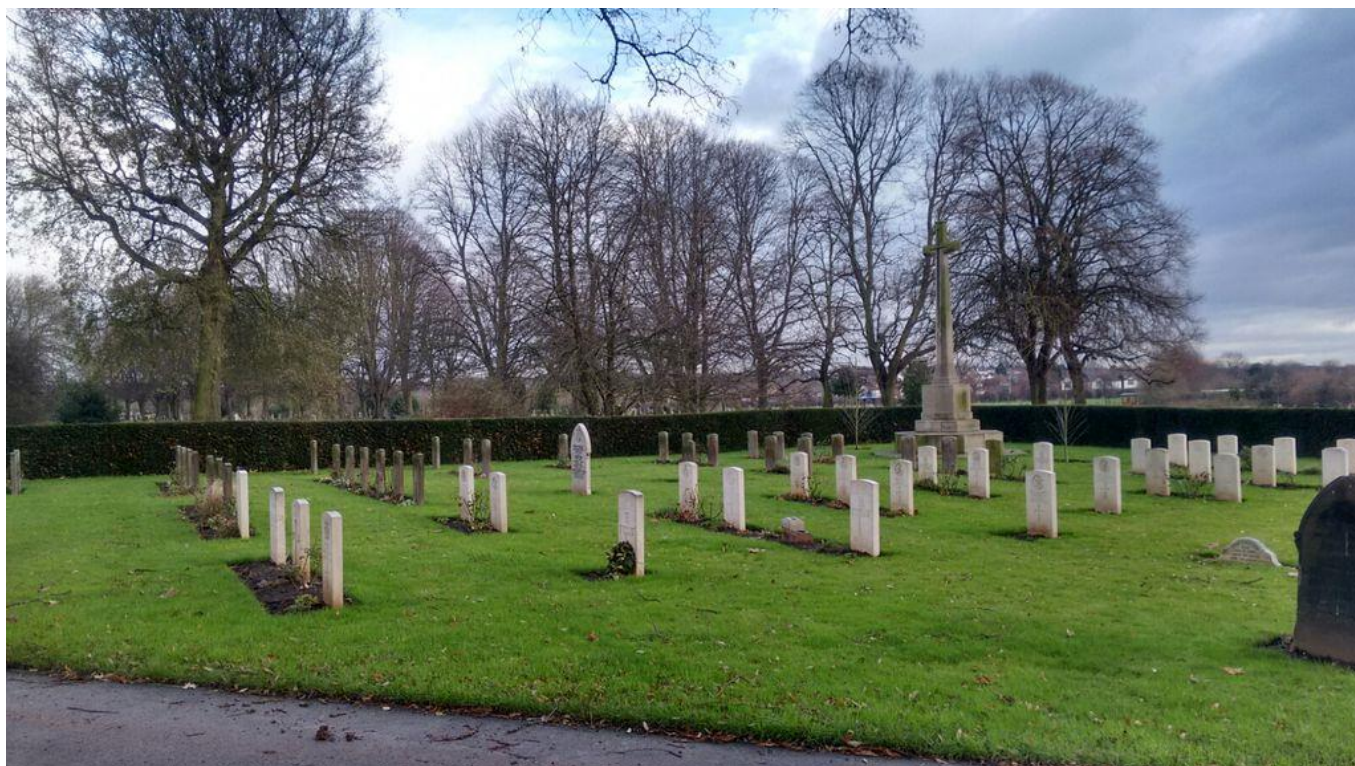
Nottingham Road Cemetery, Derby